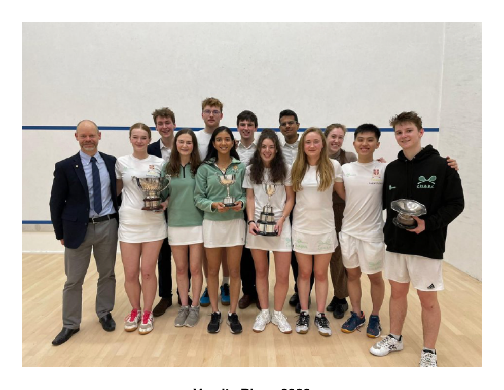
Varsity Blues 2022